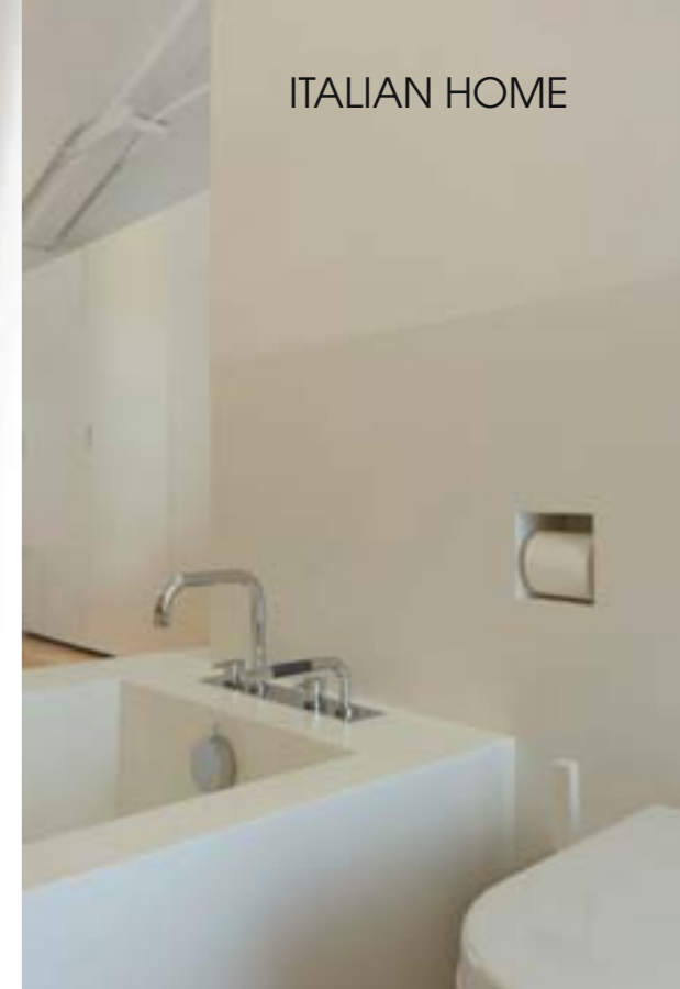
Left: An enclosed shower space is created within a niche. The flush-to-floor tray and wall-mounted showerhead are the only defining elements within the zone. Above: Brassware is counter-mounted onto the bath for convenience and to maintain the clean, minimal aesthetic within the wet space. Even the toilet-roll holder is recessed within the Corian splashback, in accordance with the architect's brief. Below: Corian dominates the surfaces in the bathroom – its seamless look perfectly complementing the interior scheme.

A similar kitchen would cost around £25,300 (€32,000) including appliances. A similar bathroom costs around £14,200 (€18,000) and a similar bedroom design would cost around £12,000 (€15,000)