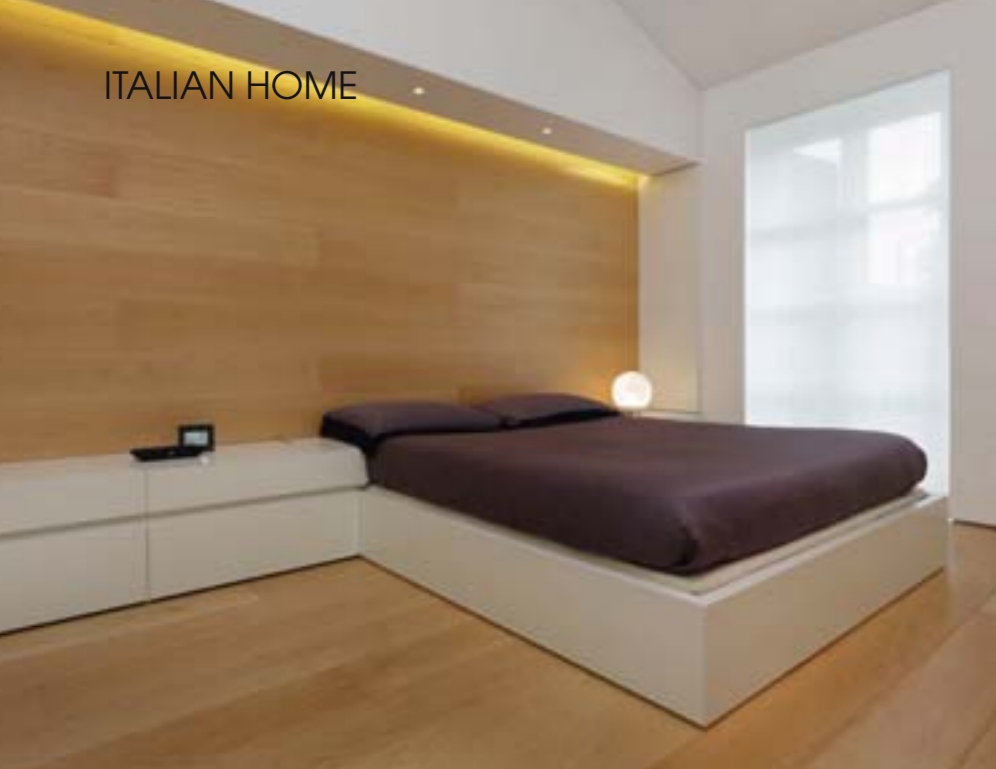
Above: Key elements within the bedroom-bathroom space, such as the bed, are formed in blocks to highlight their status. The linear recessed lighting above follows the line of the room uniting rest and bathing zones. Below: The huge bath is the only division in the space – its proportions echoing those of the bed beyond, while the linear vanity unit arrangement links with the line of bedroom furniture.

Lighting is not the only sophisticated aspect of this high-tech home. Intelligently linked through a central system, the kitchen boasts motorised drop-down cabinets above the main prepping area. The main inspiration behind the remote units was to create a blank space on the wall above, which doubles as a projection screen, the focal point of the apartment. As the only suitable surface area within the apartment, the TV projector dictated the layout of the kitchen and living area. From the dividing island unit and breakfast bar area, the couple enjoy watching TV before work each morning.